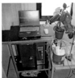
Figure 1. Test set up.

The air cleaner was placed on a desk. The concentration was measured by altering between up- and down-stream (15 mm above the outlet in the center) of the air cleaner. An ELPI (Electrical Low Pressure Impactor, Dekati FIN) was used to measure numbers and sizes of the particles.